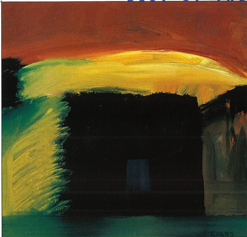
YELLOW OVER BLACK SQUARE BY DICK EVANS