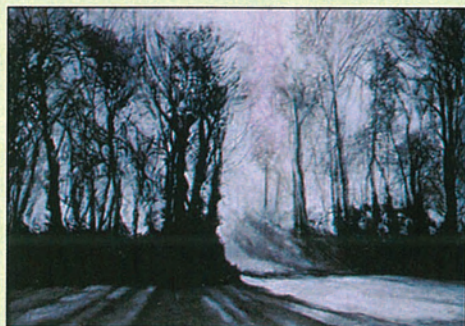
MIDNIGHT DREAMS BY JILL TISHMAN

Originals 2003: Traces of the Journey , April 27-July 20, Albuquerque Museum, 505.243.7255, www.albuquerquemuseum.com