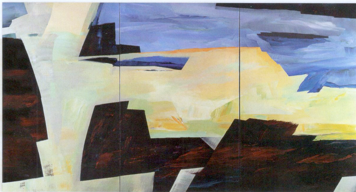
Dick Evans, Twenty-Fifth Passage, oil, 48 x 90.