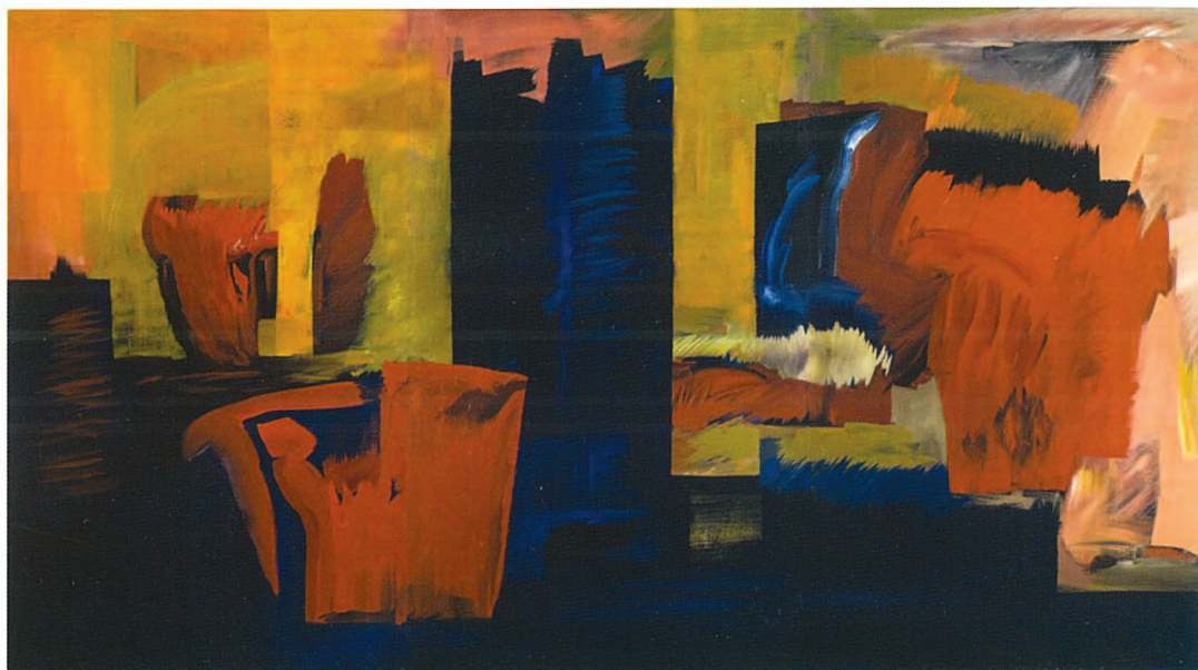
Forms in Blues, Russets and Greens | acrylic on canvas, 66 x 120 inches (triptych)

I do abstract paintings, with lots of gesture and brushstroke and color, loosely based on landscape. They are explorations, interpretations and expressions of the world around me and within me...which are ultimately the same.